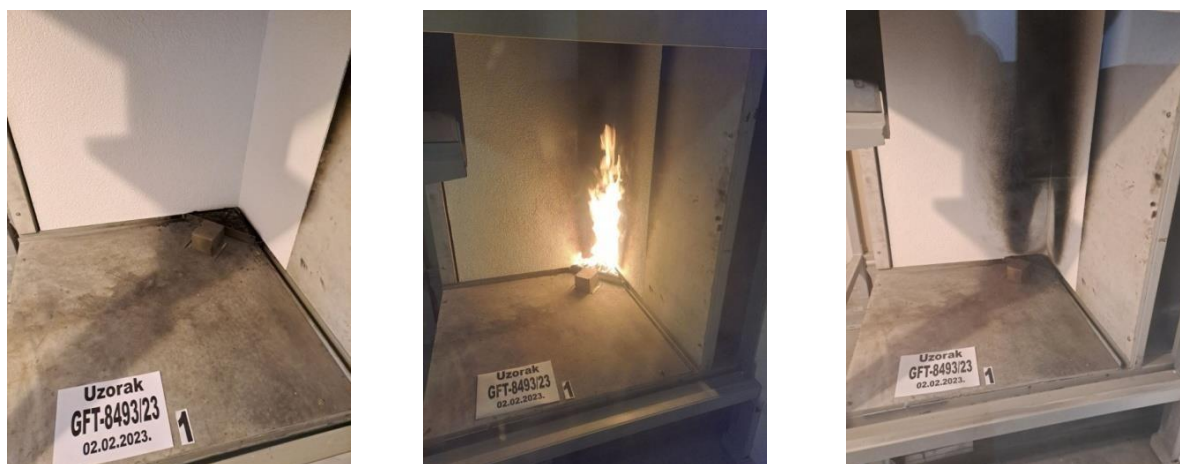
Figure 2 - Sample 1 at the beginning, at the middle and at the end of testing